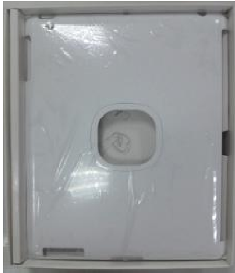
Up layer – EZ CASE