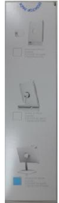
Sides view different colored sticker to each kind of pack