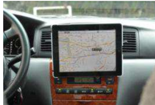
For driving safety, suggest to mount the iPad below the level of windshield.

The iPad can be pivot freely and tilt up-down or left-right for suitable viewing angle.