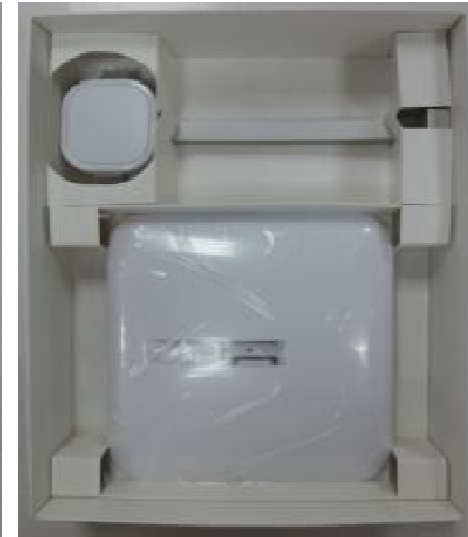
Low layer - KITS