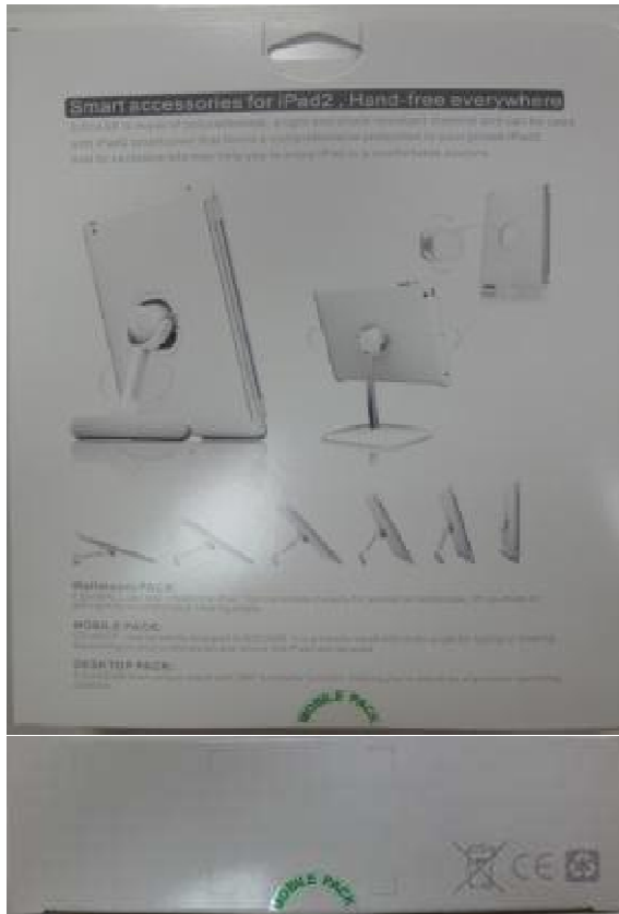
Back / Bottom view