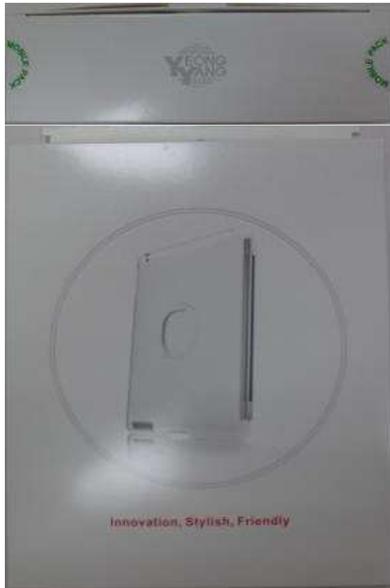
Top / Front view